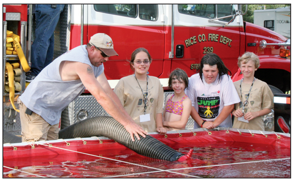
Firefighters helped youngsters learn about safety during Kids Camp sponsored by Rice County agancies.